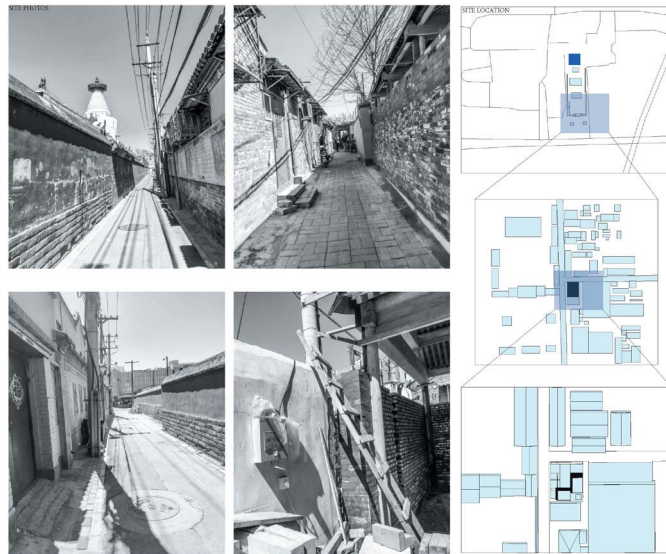
Figure 1 Beijing hutongs, site documentation and analysis (Image by Chaysen Smith, Meagan Whalen, Hannah Thomas, Megan Murray)

In any city, a corresponding set of mental images exists in the minds of those who experience it on a daily basis (Lynch, 1960). Working in nine teams, students collectively identified environmental conditions common to both cities. Inspired by Kevin Lynch's seminal The Image of the City (1960), each team selected an environmental taxonomy— infrastructures, landscapes, networks, territories, places, thresholds, edges, influences, textures —to study its specificity within each context. These lenses encouraged a critical reappraisal of contemporary approaches to urban planning and design, as well as the role of the architect-planner-designer in a context (Rowe & Koetter, 1979).