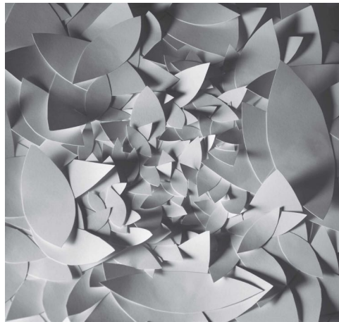
Figure 3 Beijing layering, represented as an assemblage (Image by Noura Al Balushi, Lawson Dyson, David Garcia, Caroline Mazziotti)

Diagrams and narratives were used as a documentation device to survey a diverse range of spatial territories—interior and exterior—through various art-based means. Diagrams were employed to study hierarchies, flows, and densities, while written narratives expressed urban phenomena to operationalise each taxonomy. Together, these exercises allowed students to develop an impactful project, to preserve and leverage history, and to promote strategies for improving quality of life.