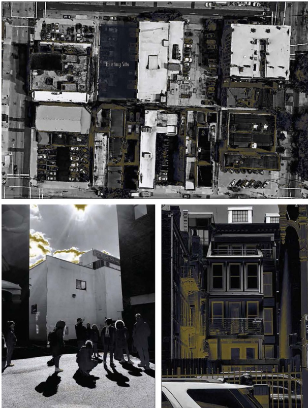
Figure 4 Cincinnati alleyways

knowledge exchange. Parallel field research in our home base of Cincinnati provided a comparative North American lens in a familiar context. Upon returning to the United States, students engaged our local context to rethink spatial potentialities and character-defining conditions of downtown alleyways in Cincinnati through a Beijing lens. In Cincinnati, place-specific attributes were identified as fire escapes, balconies, overhangs, stairways, rooftop gardens, bricked-in openings, lack of natural light, and textural changes. Residents have appropriated these surfaces with their own personal effects to temporarily transform adjacent exterior spaces for various needs ranging from food preparation to home industries.