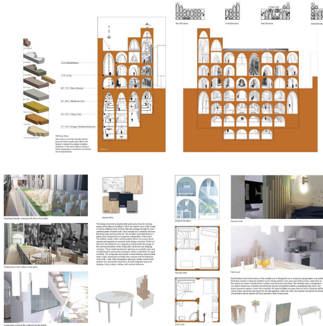
Figure 8 Beijing hutong intervention, new courtyard housing