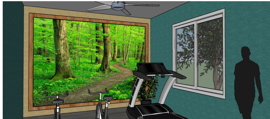
Figure 3 Exercise room

The exercise room accomplishes two things. The first is access through a variety of nature scenes and based on the attention restoration theory might help with the person's concentration levels. To help bolster the experiential qualities, the wall and screen are concave to include the scene in the person's peripheral sight. While this is an example, other design features can be explored to accommodate similar outcomes.