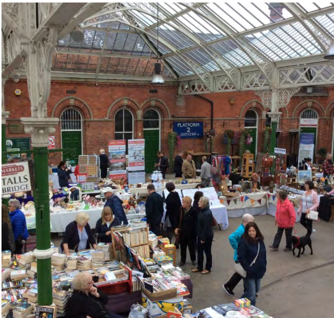
Figure 2 Tynemouth Market interior, Tynemouth, Tyne and Wear, UK

One specific case study is the Tynemouth Market, North Tyneside. The market is housed in the existing Metro station in the old Victorian station design by William Bell in 1882 to the North Eastern Railway. This is in an outside location but under the cover of an enclosed Victorian platform shelter. The market is very popular and was started as a way to utilise the empty and architecturally significant, railway station. It regularly has 80 stalls of various sizes and complexities and thrives as a strong example of local regeneration and how a market can trigger regeneration of a town and region. Its popularity is secured as it specialises in both new products, recycled, retro antiques and food and drink. It is a leisure destination enriching the local culture and community. The location within the railway station totally typifies the hybrid and binary nature of the interior.