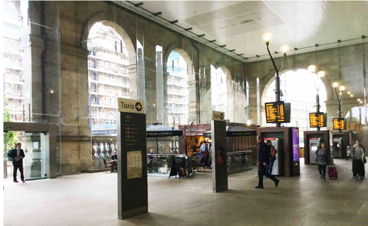
Figure 3 Newcastle Central Station Portico

McCarthy suggests that the boundaries of interiority are essentially abstract, rather than of solid substance. Although viewed as conceptual parameters, they delineate between the states of interiority and exteriority, where the boundary is transitory. Moreover, these intermediary borders determine the flexible and mobile nature of the interior, “making temporality an active condition of interiority” (McCarthy, 2005, p. 115). This notion of boundary is neither interior or exterior, but rather it exists within both realms and as such blurs the separation between inside and outside. This is highlighted by the Mobius strip configurations where the internal and external surfaces oscillate as suggested by Voordouw (2018). Instead, the terms interior and exterior are made redundant as prescriptive architectural terms tied to the physicality of the building structure. Now free of these constraints, they take on a more ethereal level of existence and meaning. Caan (2001) speaks of the interior, not only as a spatial zone but also on an emotional, intuitive and psychological level, discussing the interior space as a second layer of skin to the human user.