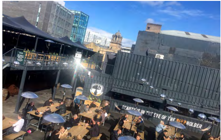
Figure 4 Stack Container Village, Newcastle upon Tyne

The configuration of the containers develops a migratory approach to the city, allowing the visitor to drift through the space, blurring the ideas of inside and outside space. A new intersection of how people use, interact and behave in the city is formed. It promotes the idea that you can be inside and outside at the same time, introducing a strong concept (favoured in many European models of culture) of bringing inside activities outside developing new boundaries and moments for the in-between space ( I-space ).