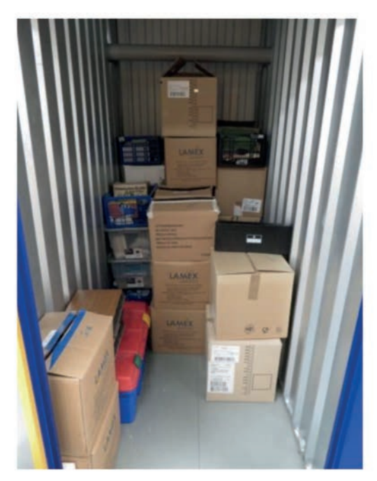
Mouse over image to zoom

Sold after 28 bids for £205.00. Contents valued at £5.85 per square foot.