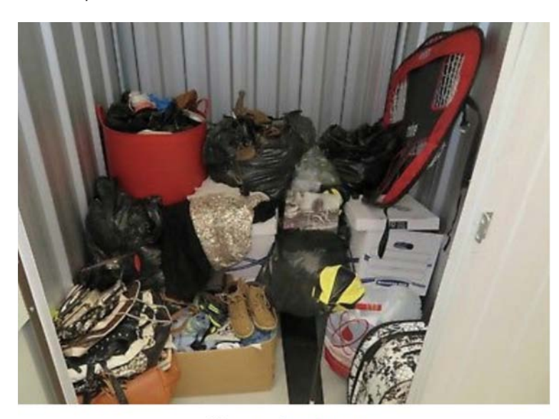
Mouse over image to zoom

Sold after 19 bids for £73.02. Contents valued at £2.92 per square foot.