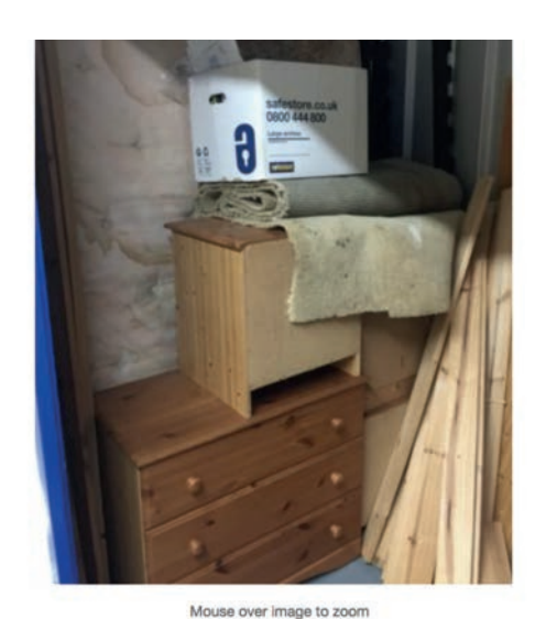
Figure 6 Image of online listing – emotional deferral (eBay)

Sold after five bids for £60.00. Contents valued at £0.80 per square foot.