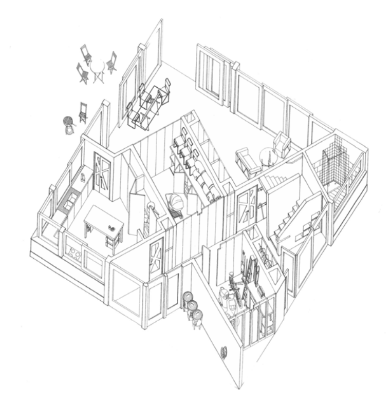
Figure 3 Axonometric drawing of the Put-away House (van den Heuvel & Risselada, 2004, p. 178. Image courtesy of Soraya Smithson on behalf of the Smithson Family Collection)

to fulfil the needs of the culture in question. The degree to which the problem of materialistic 'glut' is spatially ingested within the Put-away House is telling of a deeply symbolic significance of consumerist influences upon the function and practices of the home. In a culture where inhabitants practice identity, aspiration and freedom through consumerist rituals of material acquisition, the proliferation of the externalised form of the rented self storage unit is even more of a testament to the expressions of identity imbued in practices of material consumption.