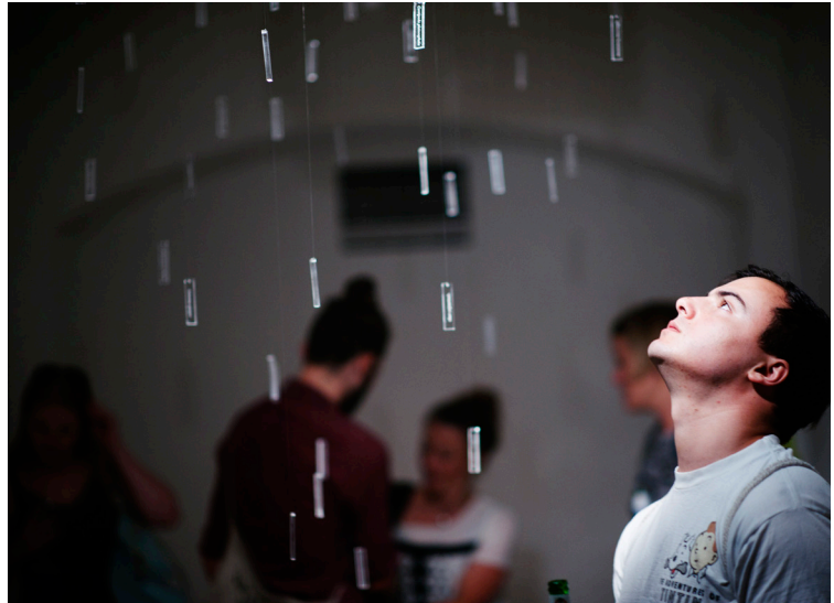
Figure 5 Etched acrylic tags moving freely in the air current

When I directed a spotlight onto the tags as they twirled about, the refracted light was thrown onto the surface of the gallery walls. Evidenced in name only, the plants' former vitality was activated by light reflecting off the tags. The ethereal and immaterial effects of light dwelt temporarily on the surface of the gallery wall. The wall's surface provided what Giuliana Bruno suggests is a form of dwelling that "... engages mediation between subjects and with objects... a surface condition creates a sensitivity to the skin of things... modes of surface encounters and connectivity take place in this theatre of surface"(Bruno, 2014, p. 94). Surface—as gallery walls—provided a dwelling that hosted the effects of refracted light off the acrylic tags. The interior gallery walls became a connective surface that was placed into dynamic relationship with its exterior landscape through the simple technology of a gallery spotlight directed onto acrylic tags.