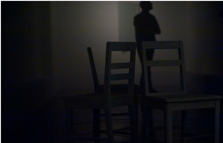
Figure 6 Echo Chamber as phenomenal soundscape.