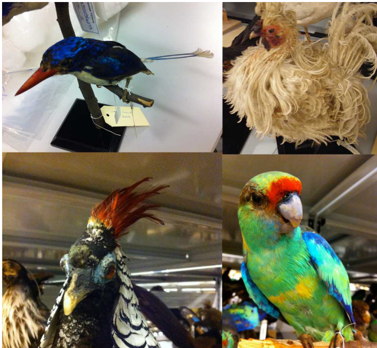
Figure 2 A selection of birds from Museum Victoria ornithology store, and London's Natural History Museum ornithology store, Tring.

The taxidermied birds presented in the dioramas at Melbourne's Museums Victoria and London's Natural History Museum provided initial inspiration, with their wide variations of size, colour, plumage and pose.