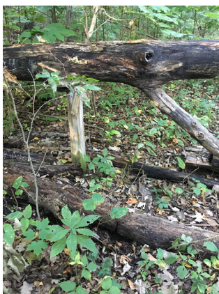
Figure 4 Fallen tree, supported by a lumber fence post

Assuring is the carefully placed lumber supporting the old tree.