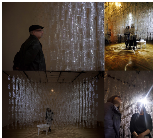
Figure 8 Veiled Space

The entangled relationship between material properties, life cycles, economics, and justice across distributed populations involved in commerce is a reality for all designers. My use of the water bottle mimics the kind of judgement based on access, affordability, and end-of-life assumptions that drive many design decisions. Choosing what is best for a particular situation is not straightforward, and there is always haste in judgment due to the politics of design. However, a vessel that distorted and reflected, giving rise to visual ambiguity, within a complex social, cultural and economic narrative, indeed, embodied interiority.