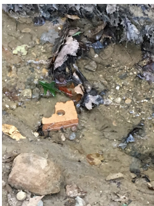
Figure 3 The typically dried-up creek bed after rain

Serene is the water gently flowing around broken bits of brick and concrete.