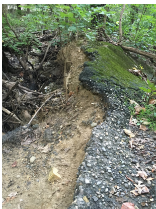
Figure 2 Moss on asphalt

But how beautiful is the moss carpeting the dark asphalt, its raw edge broken and exposed.