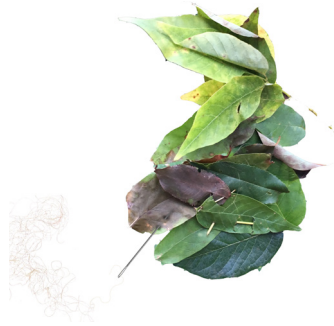
Figure 5 Experimentation with materials

tapestry of collected leaves and grasses from four distant locations (Figure 5 and Figure 6).