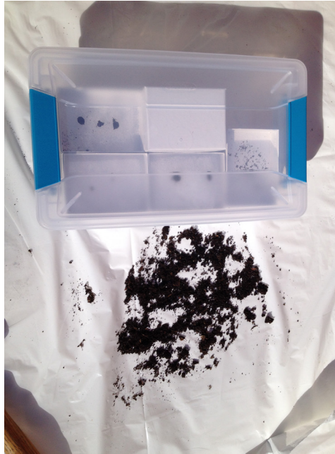
Figure 1 Dirt curation

This led to the discovery that the soil in my possession was actually from a completely different park, albeit not far from the arboretum.