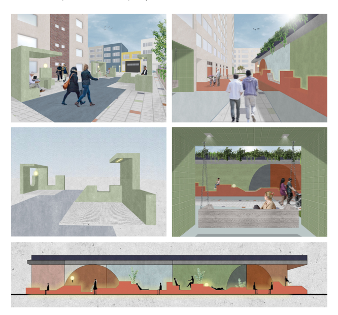
Figure 7 Urban interior interventions that afford multiple use and various spheres

configurations that strongly refer to the spatial dimension of an interior space built up by elements that facilitate domestic actions.