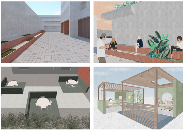
Rienske De Baere) Jandscape affords working (RAAAF, n.d.).

The passageway between the apartment building and the bunker is relatively long and broad. Massive, greyish walls flanked it without any significance. As the passageway is not furnished by any sort of urban interior, it evokes no reason to pause or sit down. The student wanted to transform this transition area into a space that would encourage people to slow down, stop, and stay for a while. In a first design proposal, the student designed a longitudinal bench along the bunker wall. This bench consisted of a two-step alike sitting element, which regularly was divided by integrated planters. The niches on the opposite side in the plinth of the apartment building were accentuated by colour in the proposal. Further, the student designed a new tile pattern for the walkway itself.