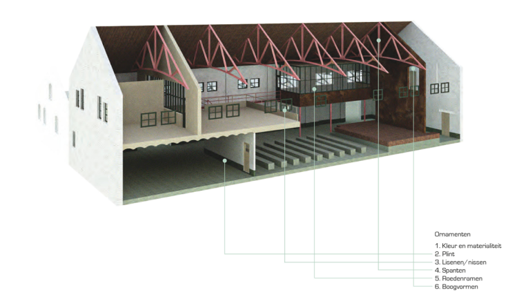
Figure 3 Preliminary design proposal. Structural elements pronounced by colour (Image by Lotte van Alphen)