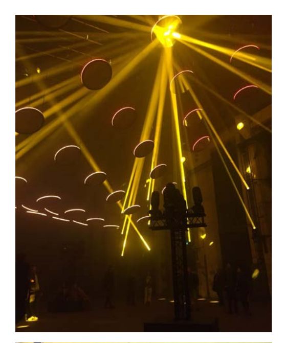
Figure 9 Tate Modern Turbine Hall by Superflex