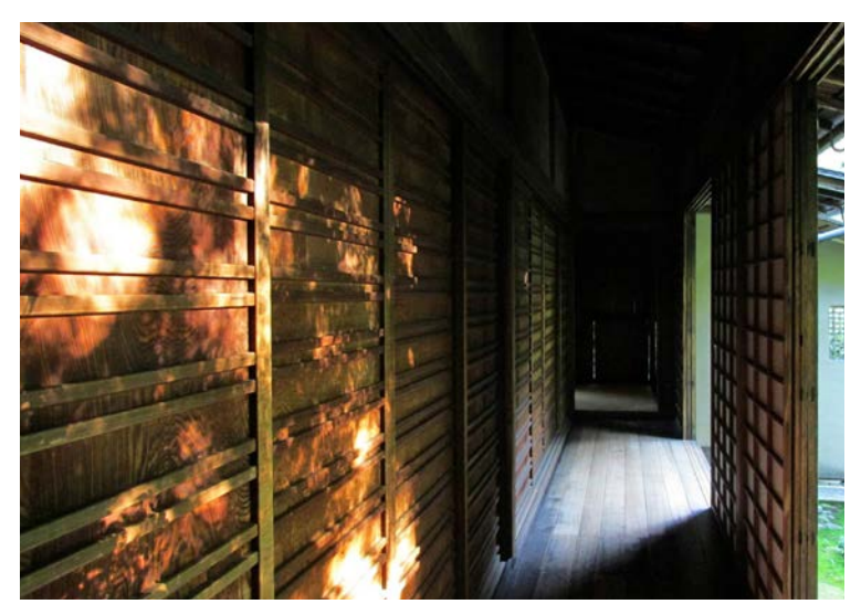
Figure 5 House in Kyoto, Japan

In his dream world novel, Invisible Cities , Calvino (1974) implies that at any given moment, there is more than one reality which we can experience through imagination. If we look at the world as more similar to the realm of dreams than to a scientific doctrine, we might experience existential and lived space rather than physical and geometric. The question of what a substance is was raised as early as 340BC by the Greek philosopher Aristotle, who claimed there is a unique single substance that interconnects all activity, matter and motion (as cited in Cohen, 2000). Similarly, the Japanese concept of Ma , best described as "gap" or also as "the complex network of relationships between people and objects" (McLuhan, 2005, p. 157) is not created by compositional elements but takes place in the imagination of the viewer. This concept is superbly illustrated in Japanese architecture, where beauty and serenity rely solely upon the varieties of light and shadow, hitting still surfaces.