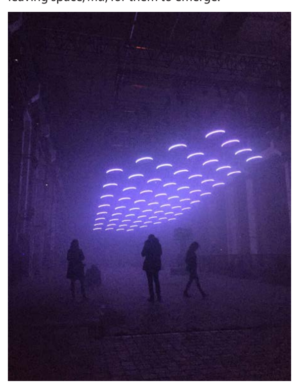
Figure 8 Skalar by Christopher Bauder

In a different manner, Christopher Bauder creates immersive installations through another intangible medium – light. His works use mirrors, projectors and sound to create multi-sensorial symphonies that embrace the visitors in unusual settings. When I visited his installation Skalar in Berlin (Figure 8), I noticed how people were completely submerged into the creation and every mind was reflecting and having a different experience in the same space. Indeed, I believe it is our capacity to create our own versions of where we are, be able to tell our own stories from the same places that is one of the greatest gifts we have as human beings. Interiors can stimulate our minds to create our own worlds and scenarios by leaving space, Ma , for them to emerge.