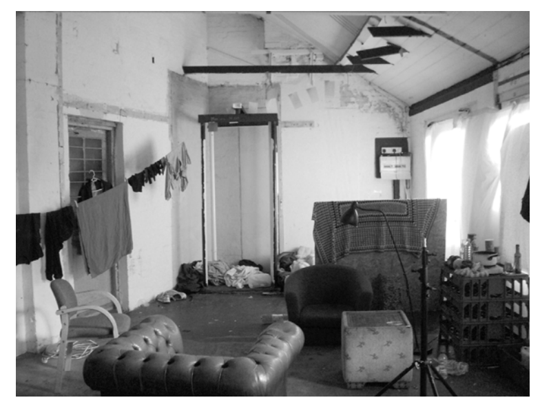
Figure 4 Re-adaptation: Squat house in London

occupants as it existed in a particular time period. The interior is a constantly changing response to people's needs and lives that justifies the building's presence. Interiors exist in the continuum of time, undertaking different states of transition, to become collages, meeting points of architecture and design, of people and objects, of past and present and of living and dead. Careful attention has to be put in preserving the memory of old buildings when they need to be adapted to new functions. Re-adaptation should substitute renovation, and the designer's task is to inject new life into the old structure by enchanting its value and memories throughout the space, adding the next layer of its history instead of substituting it or locking it in a frame or behind glass.