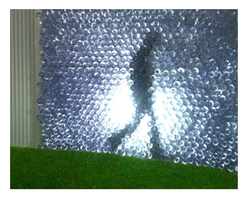
Figure 12 eArth transitions : Author's project

motion, a mixture of matter and substance that interact with each other. If we see beyond our visual perception, we may start to re-conceptualize objects not with their form and exterior but rather their invisible qualities. For example, jewellery is gold given specific character from the designer, earth can be moulded into tiles and ceramics, space is a framed void in which our interactions act on and simultaneously are influenced from. We may begin by understanding separate objects and fields as a whole. Herzog and de Meuron portray this notion in architecture implying that "matter is but a means to an end: the immaterial, mental processes of understanding, learning, and developing always have a priority" (de Meuron, 2002).