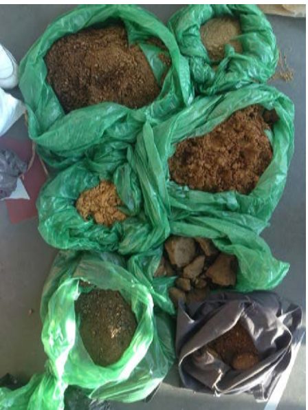
Figure 14 London Fog #03779 by Fujiko Nakaya

This experience has also aspired to picture the void by intensifying our awareness of it and to illustrate the physical presence of light in space by immersing the visitors in the complete void, lacking any other presence but that of the human bodies, light and air. Using a single module, BIG's 2016 Serpentine Pavilion created the illusion that one is in a different space observing from every new angle. In the White Cube gallery, artist Larry Bell also plays with spatial