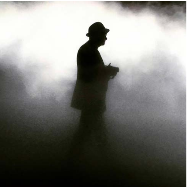
Figure 16 Smoke on the Bottom by Larry Bell