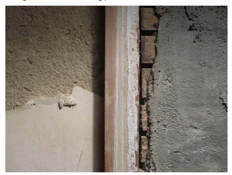
Figure 3 Layers of skin: House in Kyoto, Japan

The need to share emotions, experiences and to record the presence of our being has been a human trait since our very evolving as human beings with cave paintings emerging more than 30,000 years ago. Today our memories are subjects of recording devices and our minds become more and more dependent on them. If we lose data, pictures or our social media accounts for even a short time, we feel anxious and empty because our memory palaces are deserted. The technology utilises the way we store information, however, it also takes away our experience of it and the curiosity of discovering and identifying characters of those who imprinted traces and hidden messages in our surroundings. Steven Holl believes that natural materials preserve the plasticity of a building and preserve our experience of space (Holl et al., 2006, p. 31). Undeniably, natural textures, colours, patterns and smells convey the true essence of materiality and respond to the natural course of life – reproducing, ageing, breathing, dying. The tendency to build in artificial and plastic materials to compete for the continuum of time with longevity deprives interior spaces of character and opposes their genuine nature of being provisional.