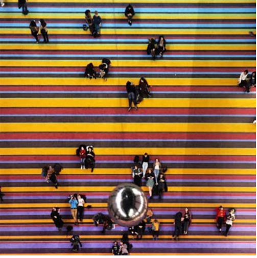
Figure 10 One Two Three Swing! by Superflex

Empathy recognises our human entanglement with spaces and objects the way we recognise ourselves in other beings. Jorge Luis Borges beautifully describes these phenomena - a man, he says, "sets himself the task of portraying the world. Over the years he fills a given surface with images of provinces and kingdoms, mountains, bays, ships, islands, fish, rooms, instruments, heavenly bodies, horses, and people. Shortly before he dies he discovers that this patient labyrinth of lines is a drawing of his own face" (as cited in Pallasmaa, 2009, p.124). Similarly, the notion of projective identification implies