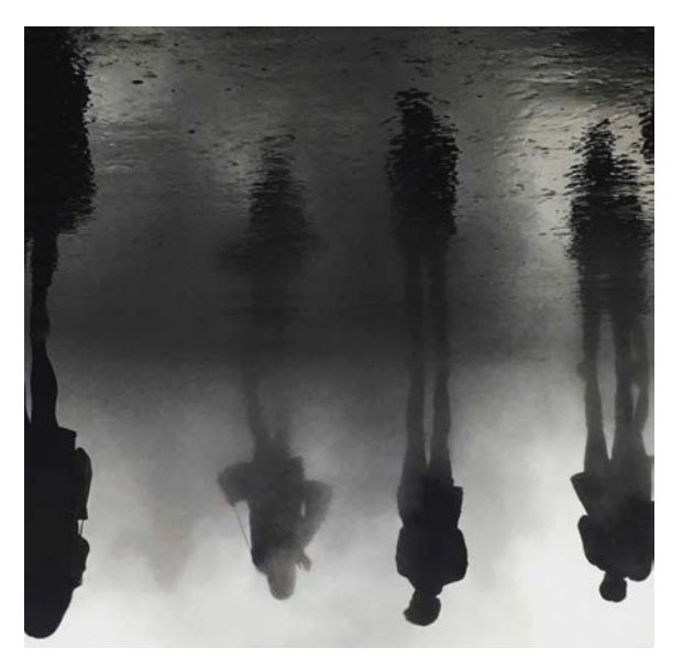
Figure 17 Mirror Maze by Es Devlin

In 2014 as part of the London Festival of Architecture, I and a few other students were challenged to create a temporary installation within the Balfron Tower before it was given to developers for a complete renovation. It was a modern take on the crooked house where disorientation of the viewer was at the crux of the experience. We created a set of spatial sequences where perspective is morphed to change the relationships between audience and space, and reveal deeper stories about the building.