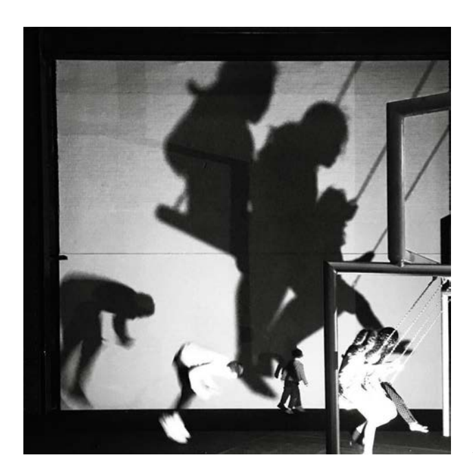
Figure 11 Vertical Village: Author's project

Imagination occurs constantly while walking around our cities. We give meaning to things that others might discard by projecting our living characteristics onto them. We experience the world through our senses but imagination recreates it so that our world is different from that of others. Artists and designers have used the interior space as a site to try and find answers to the questions of how we dwell, by representing its physical and conceptual boundaries in spatial occupation. Re-conceptualising those boundaries also re-defines our perception of negative matter and the invisible. Pallasmaa (2009) points out that "we do not live in an objective world of matter and facts, as commonplace naive realism assumes. The characteristically human mode of existence takes place in the worlds of possibilities, moulded by our capacities of fantasy and imagination" (p. 127). In this case, positive space is replaced by the negative, physical by the imaginary and the senses are surpassed by mind. If our ability to imagine is diminished by external factors, the risk of an incomprehensible future is tremendous.