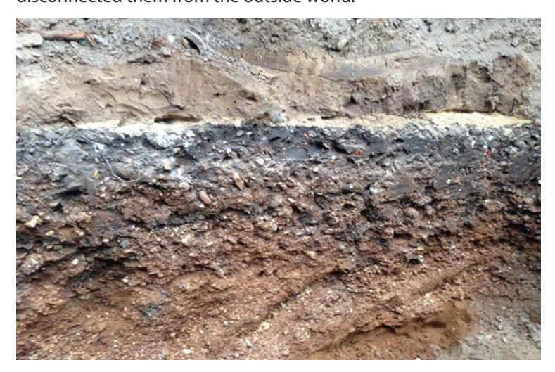
Figure 13 London Fog #03779 by Fujiko Nakaya

in the sea or high up in the mountain. Visitors were encouraged to get lost in an immersing fog of that changes continuously and disconnected them from the outside world.