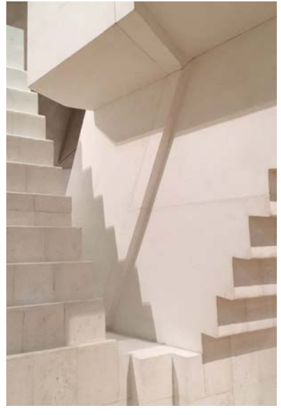
Figure 7 Sculpture by Rachel Whiteread