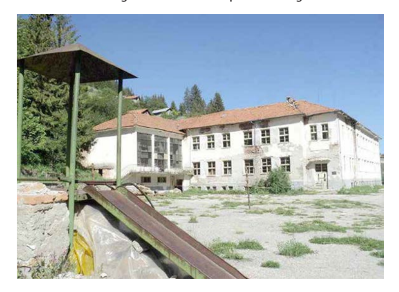
Figure 2 Mugla School Exterior

whole architecture of a village, its streets, its people - gradually disappearing but leaving the palaces of their presence behind. Even though I did not see it as a school, when I first entered the building to stay overnight with my family, I could feel the once loud corridors, filled with reflections and refractions of sounds from children's footsteps and laughter. The walls were covered with drawings of students and the shelves were still full of books and toys, serving once as primary guides and first understandings of the world to the young students. More than a decade later, completely abandoned, I experienced the building as a stratum of numerous phases it had been through and the variety of guests it had welcomed. Enveloped in sinister beauty, the school seemed like it still had a life of its own, no longer interacting with human beings but solely with nature and its forces that gently subtracted from its physical presence, but nevertheless adding more value to its spiritual being.